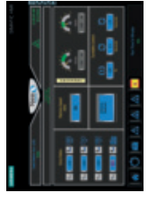
Delta-Nit Pad Screen

Two (2) matched 9-inch (22.5 cm) diameter rolls extract the maximum moisture in tubular form from the fabric tube. The Delta-Nit 2-Roll Pad is an effective extractor.